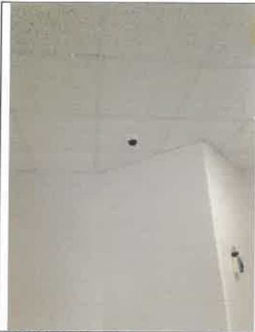
Exhibit A- Security cameras in hallway