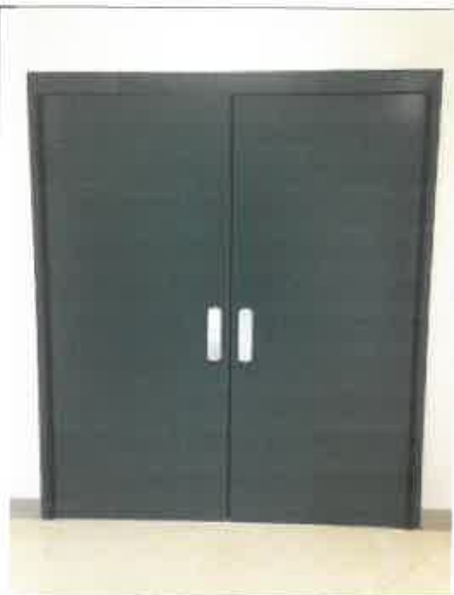
Exhibit B- Doors without handles