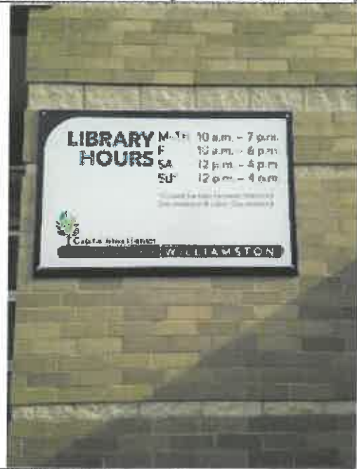
Exhibit C- Library hours